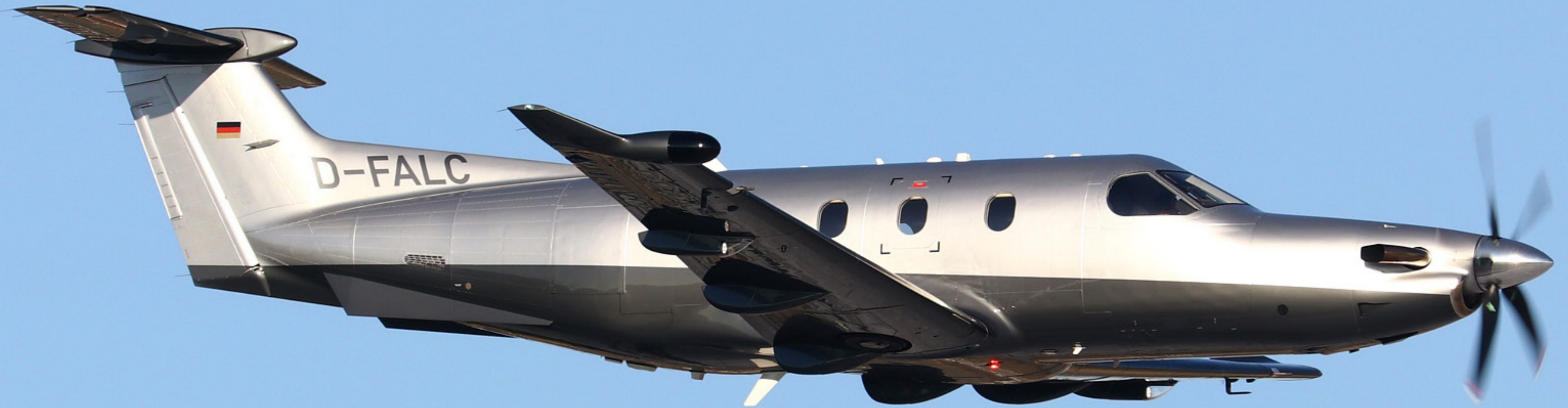
2017 Pilatus PC12NG SN 1689